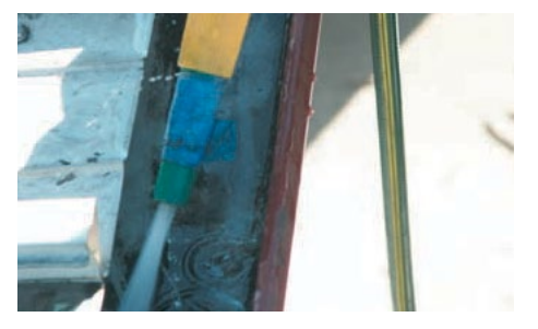
4. Rinse the gutter with water to soften and break up the dirt.