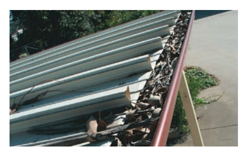
1. A typical suburban gutter clogged with leaf litter prior to cleaning.